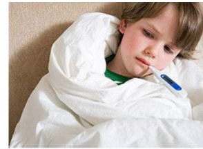
Stay away from viruses

High-performance mobile UV irradiation tower for ambient air and surface disinfection as optimal, quick, silent, touchless supplement to wipe disinfection.